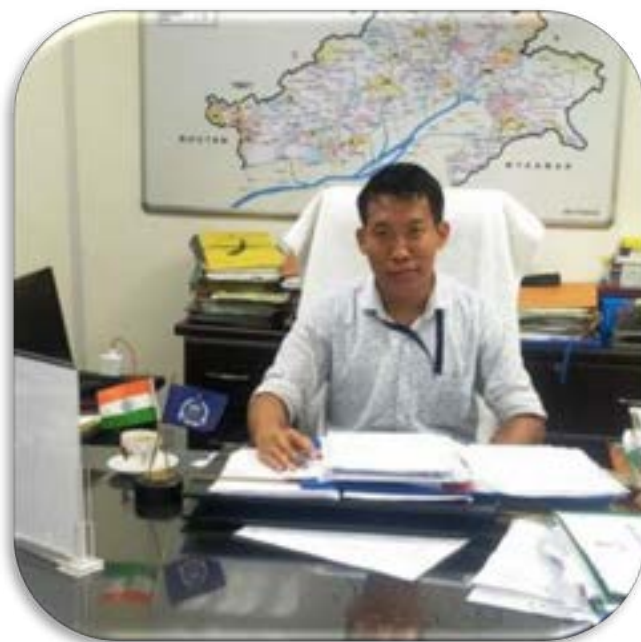
Ranphowa Ngowa IFS, Additional Secretary Department of Education, Govt. of Arunachal Pradesh